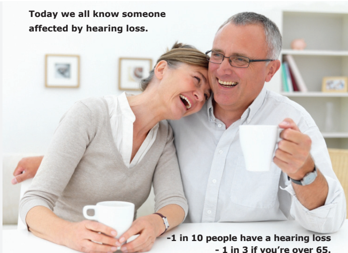
-1 in 10 people have a hearing loss - 1 in 3 if you're over 65.

Today we all know someone affected by hearing loss.